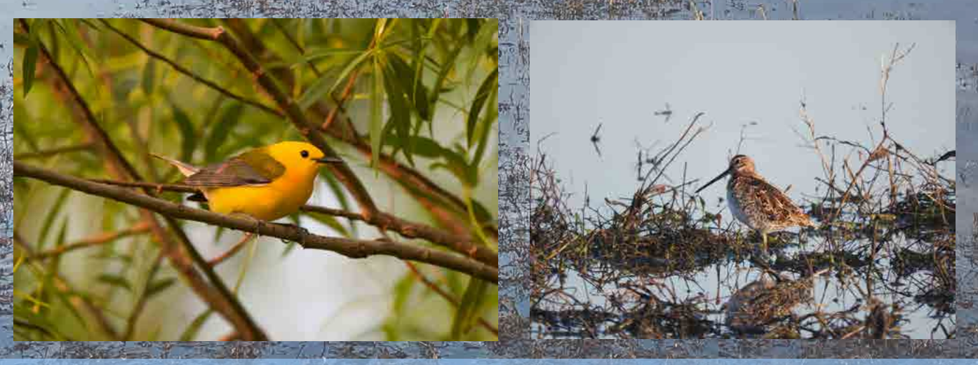
Notes: As in previous years, this easement harbored a remarkable amount of avian diversity during this year's surveys. Highlights included many breeding Prothonotary Warblers (left) and good numbers of Wilson's Snipe (right) during migration. Though our survey occurred just two days later than in 2018, due to the extremely variable nature of migration, numbers of several species were significantly different. This does not reflect any detrimental changes in the habitat provided by this site in 2019.