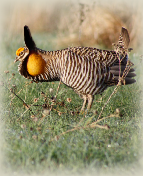
Greater Prairie-Chicken (GRPC)

Greater Prairie-Chickens have been detected on Dunn Ranch, the Frank Ranch, Poteet Farms and Pawnee Prairie in the Grand River Grasslands CCS, on Taberville and Wah'Kon-Tah Prairies in the Upper Osage Grasslands CCS, and near Wade & June Shelton Memorial Conservation Area. Eight were detected on Taberville CA and one was detected on Prairie CA in 2018.