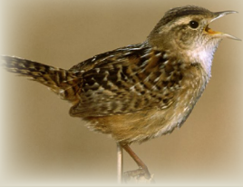
Sedge Wren (SEWR)