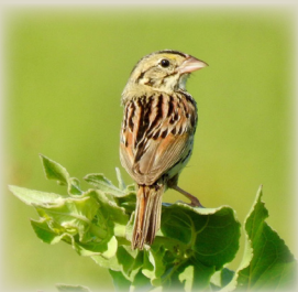
Henslow's Sparrow (HESP)