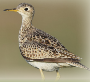
Upland Sandpiper (UPSA)