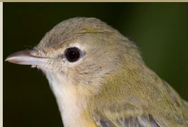
Bell's Vireo (BEVI)