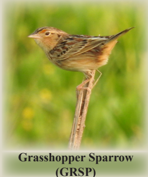
Grasshopper Sparrow (GRSP)

n = total number of observations during transect surveys. D = estimated density in birds/acre generated by Program Distance based on pooled data from all survey years and locations. Density calculated only if n > 10 for a property. CV = coefficient of variance. If no n, D or CV values are presented, the property was not surveyed in that year. Overall change in density from first survey year to last survey year. If no value is presented, data were not sufficient to calculate density in one or more years, but suggested trends are indicated by color.