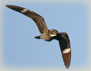
Common Nighthawk (CONI)

The Common Nighthawk was historically a bird of the prairies, old fields and traditional farmsteads. It is now very scarce in Missouri during breeding season and most often found in towns. This species has been documented at Linscomb, Diamond Grove, Osage Prairie, Shawnee Trail, Stony Point, Talbot and Wah’Kon-tah.