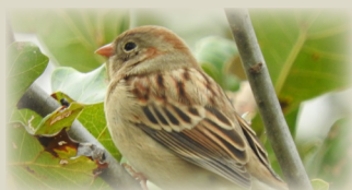
Field Sparrow (FISP)