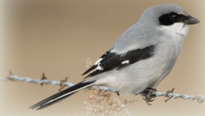
Loggerhead Shrike (LOSH)

Loggerhead Shrikes have been detected on Dunn Ranch, the Leuken-Hensley Ranch, the Frank Ranch and Poteet Farms in the Grand River Grasslands CCS, on Hi Lonesome Prairie and Ionia Ridge in the Cole Camp Prairies COA, on Wah’Kon-Tah Prairie and the Morton property in the Upper Osage Grasslands CCS, and on the Theurer Ranch in the Golden Grasslands CCS.